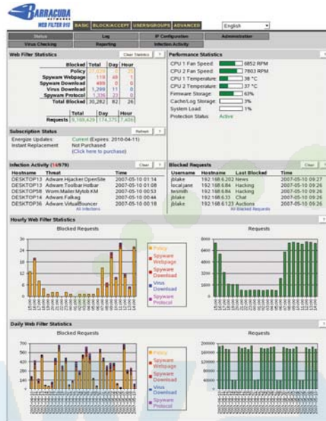
The Barracuda Web Filter monitors attempted policy violations, blocked spyware downloads, blocked virus downloads and infected clients.

With no software to install or network modifications required, the Barracuda Web Filter is easy to set up. Energize Updates are delivered automatically by Barracuda Central, an advanced technology center where engineers work continuously to provide the most effective methods to combat the ever changing spyware and virus variants. Energize Updates, including the latest spyware definitions, virus definitions, content filter categories and security updates, are distributed hourly for continuous protection against the latest threats.