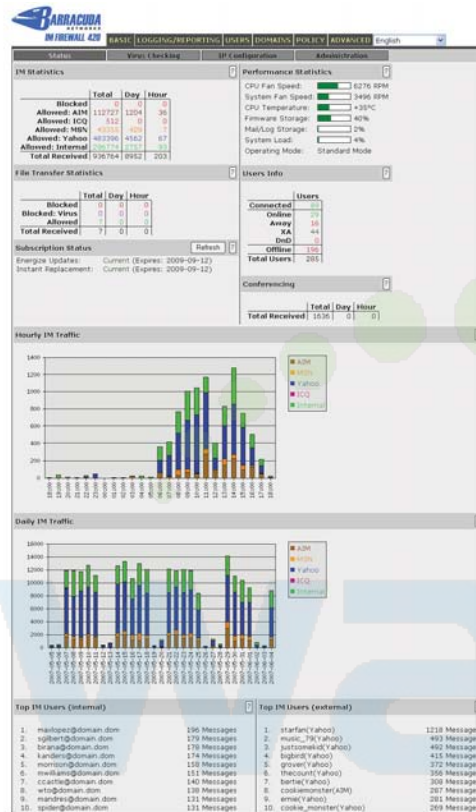
The Barracuda IM Firewall controls and logs internal and external instant messaging traffic to enforce policies for content filtering, file transfers, IM access controls and virus protection.

Whether your internal IM plans require managing public IM traffic, or require installing an internal IM server and client, the Barracuda IM Firewall has your IM needs covered. The Barracuda IM Firewall provides tools to manage public IM traffic, as well as an integrated IM server and client to provide a secure internal IM network for your organization.