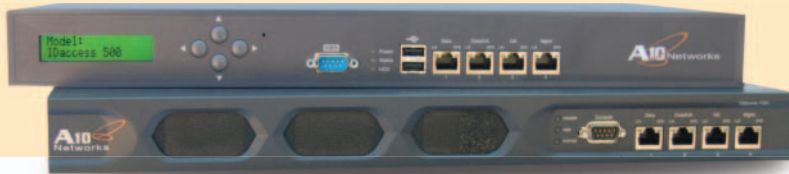
IDaccess 500 & IDaccess 800

A10 Networks' IDaccess™ series of appliances are the industry's most cost-effective, integrated Network Authentication and Guest Network Access solutions in their class. As part of A10's ID Series for identity management, the IDaccess family are purpose-built, security hardened 1U appliances that integrate RADIUS, DHCP, Guest Access and A10's unique IP-to-ID Service. The IDaccess appliances support comprehensive authentication methods and a wide-array of back end servers. By combining authenticated DHCP with a guest access portal, network administrators are empowered with a powerful and flexible network management tool to support all network and guest authentication needs.